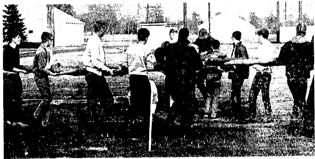
SETTING UP CAMP: Some 5,000 Cub Scouts, Boy Scouts and Explorer Scouts from Berrien, Cass and Van Buren counties are seen setting up camp for the annual "Scout Fun Fair," being held this weekend at the Youth Fair Grounds in Berrien Springs. The event is expected to draw nearly 20,000 persons

The Farm Section which normally is run in the Friday edition of this newspaper will be found in Saturday's paper this week.