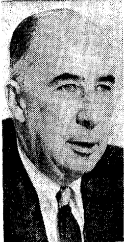
JOHN N. MITCHELL U. S. Attorney General

spoke in the role of the nation's senior law enforcement officer in demanding a halt to campus turmoil. His speech was drafted during policy consultations with President Nixon and FBI Director J. Edgar Hoover. PATIENCE IS GONE "This administration has tried to be patient," Mitchell said, "in the hope that students, faculty and local officials, working together, would put an end to this chaos.