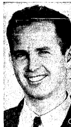
GOV. WILLIAM MILLIKEN